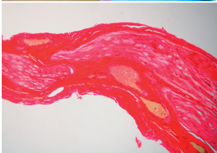
Fig. 2. Histological microscopical section of the fibrotic ilioinguinal nerve.

the girl all had an inguinal hernia repair during their childhood. Based on the family history, the personal past history, the physical and ultrasound examination and the results of the infiltration therapy the diagnosis of an inguinal hernia with nerve entrapment was inevitable (Table 3). Intraoperatively (29.1.2007) the defect of the posterior floor and the nerve entrapment was verified. The ilioinguinal nerve was caught in the externus aponeurosis and bend in a 90° angle (Fig. 1).