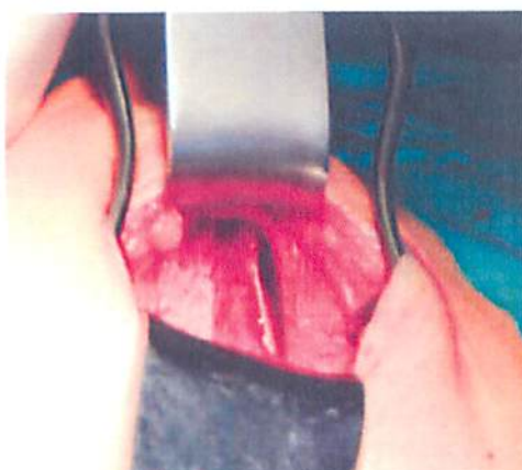
Figure 3 Below the external fascia there is fibrous scar tissue around the inguinal nerve.

entrapment neuralgia after open and laparoscopic hernia repair has been reported in up to 12% of patients [12] and may cause disabling pain [13]. Patients with neuralgia may suffer a longtime - more than 10 years - until a cause for the chronic pain in the groin can be established. Obviously there is no simple solution to the problem. It is questionable to recommend endoscopic technique as prophylactic measure [14-16].