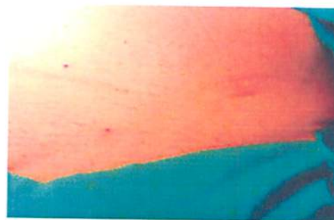
Figure 1 Left groin with scar caused by trocar insertion.

Inguinodynia is the second most common complication occurring after inguinal hernia repair [5], reason enough to look for prophylaxis. However, inguinal neuralgia [6] and injury to nerves after inguinal hernia surgery [7] were not considered as an important common risk factor. Nerve injury has been reported to occur in 2% of laparoscopic hernia repair and to be