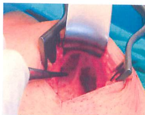
Figure 2 Inspection of the left lateral groin with scar tissue resulting from the trocar insertion above the external fascia.